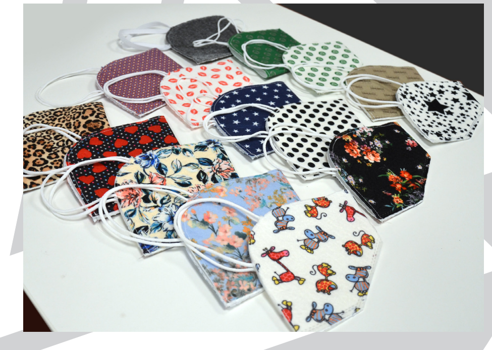
GREY standard mask